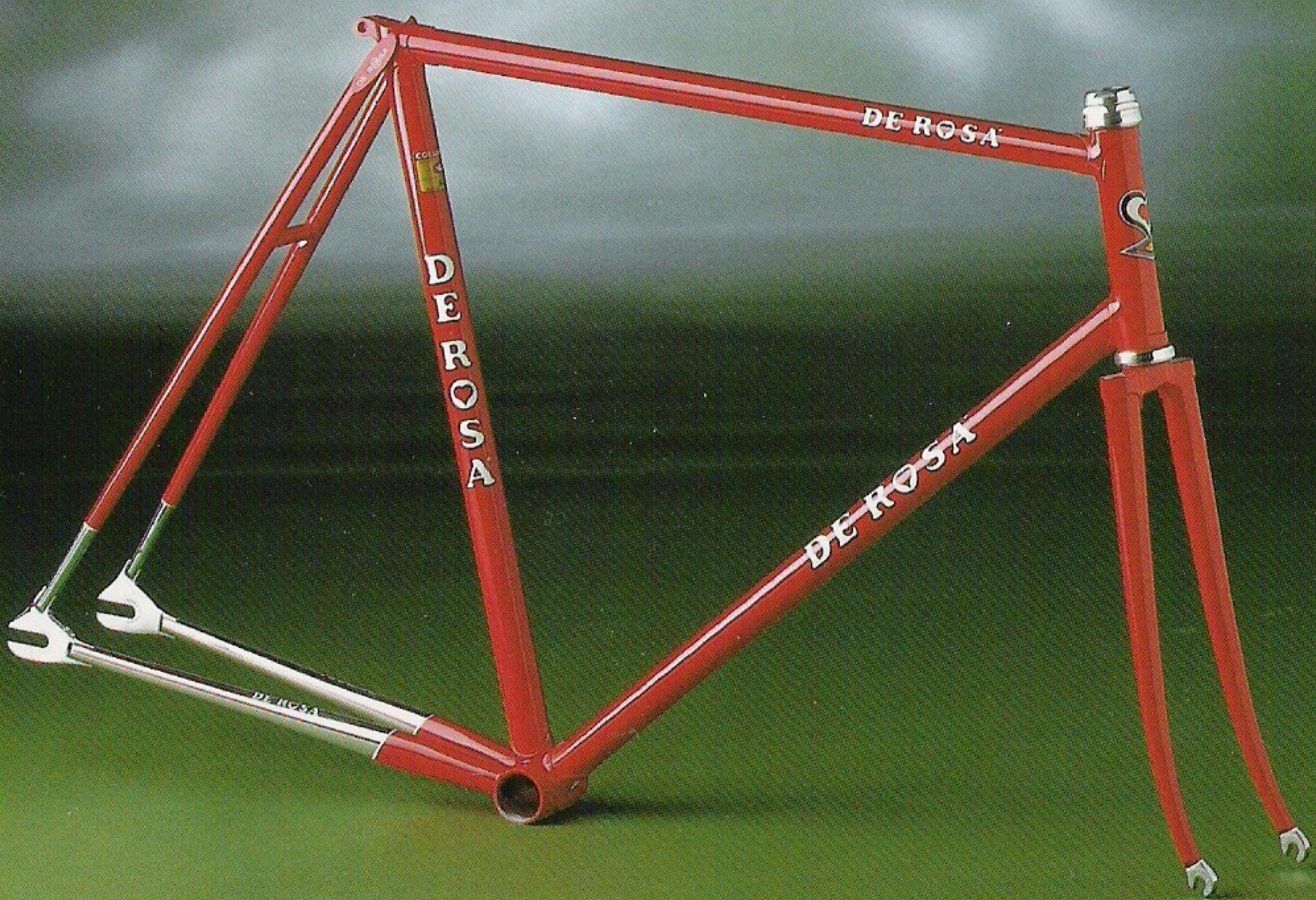
Prograf (Verona) - Printed in Italy

Tubing: Columbus SL. Lugs: Investment cast bridgeless bottom bracket shell, flat fork crown, and lug set. Dropouts: Campagnolo pista. Sizes: 48 cm. to 62 cm. in 1 cm. increments, measured center to center. Chrome: Front fork, chainstays. Colors: Azzurro, Ferrari Red